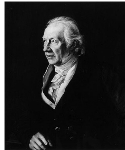
Carl Friedrich Zelter

The Singakademie was a unique ensemble in many ways. It was composed mostly of amateur singers, mostly from the wealthier strata of society, and met to learn and rehearse music but not necessarily to present it in public performance. Equally unusual was their dedication to music of the past, especially that of Bach. Under Zelter's 30-year tutelage, the ensemble grew in size and reputation, and became the model for the many amateur ensembles that sprang up in the 19th century, including Mendelssohn Club. Zelter revered Bach and had acquired a vast collection of manuscripts for the Singakademie library, mostly